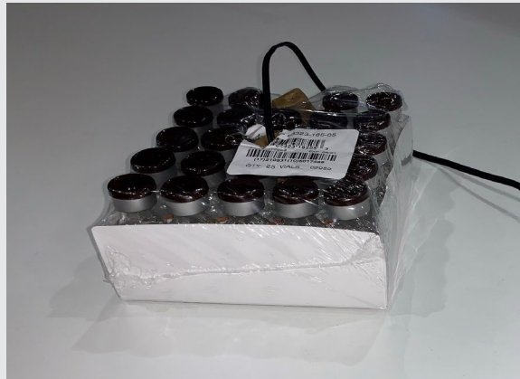
Fig 1: Packout 25 x 5mL